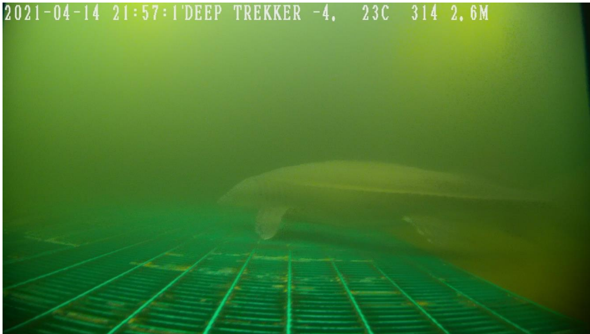
Figure 2: A white sturgeon in the entrance section of the NFL. The date and time on the ROV have since been updated to show the actual date/time.